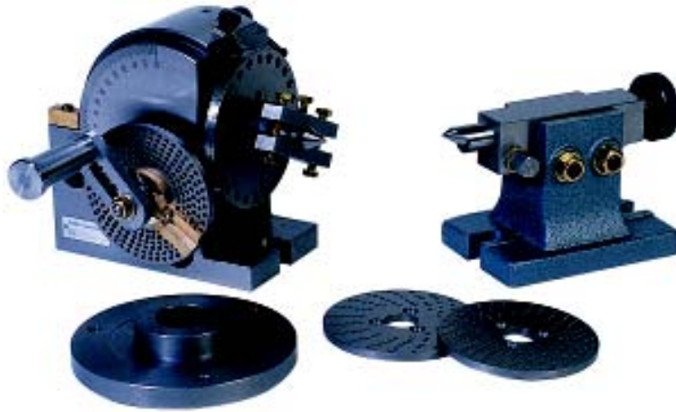
No. 550-030, -031 Semi-Universal