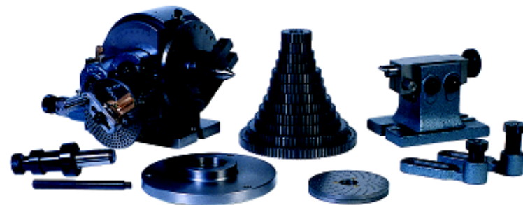
No. 550-032, -033 Universal Dividing Head